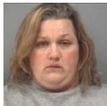
Parents allegedly 'hog-tied' son 2 days ago