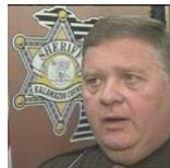
Reality of Kzoo deputy cuts sets in 5 days ago