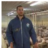
Holland farmer loses money to MF Global New Today!