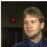
Shot student settles with Ottawa deputy 1 day ago