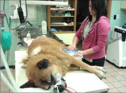
Boris the dog undergoes adult animal stem cell therapy at a Walker animal clinic (Dec. 13, 2011)