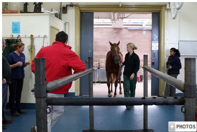
Stem cell A racehorse undergoes a stem cell procedure to heal a tendon injury at the University of Sydney vet teaching hospital.

The treatment, which involves stem cells being harvested from the animal's own fat deposits, has become an emerging procedure for animals with tendon injuries and osteoarthritis.