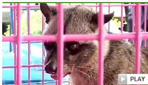
Saved from the dinner plate Thai customs officers rescue over 2,000 endangered animals bound for restaurants in southern Thailand.